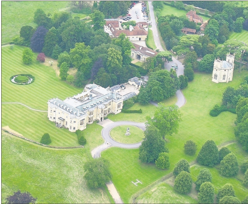
Hartwell House Hotel and Spa is set within 90 acres of its own parkland.

Laura Nightingale enjoys an overnight stay at historic Grade I property