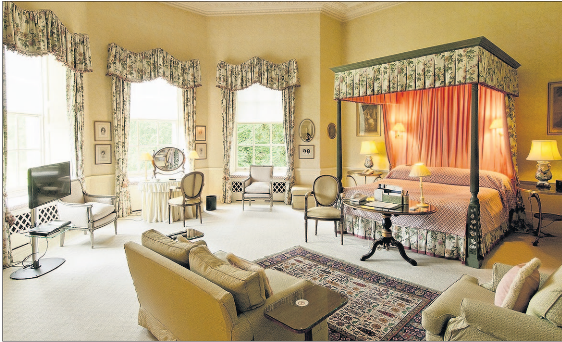
One of the sumptuous rooms at Hartwell House Hotel.

while my partner opted for smoked chicken and wood pigeon sausage.