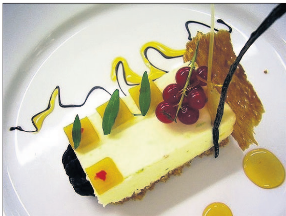
Choosing a pudding was a tricky business.

Address: Hartwell House, Aylesbury, Buckinghamshire, HP17 8NR. Telephone: 01296 747444.