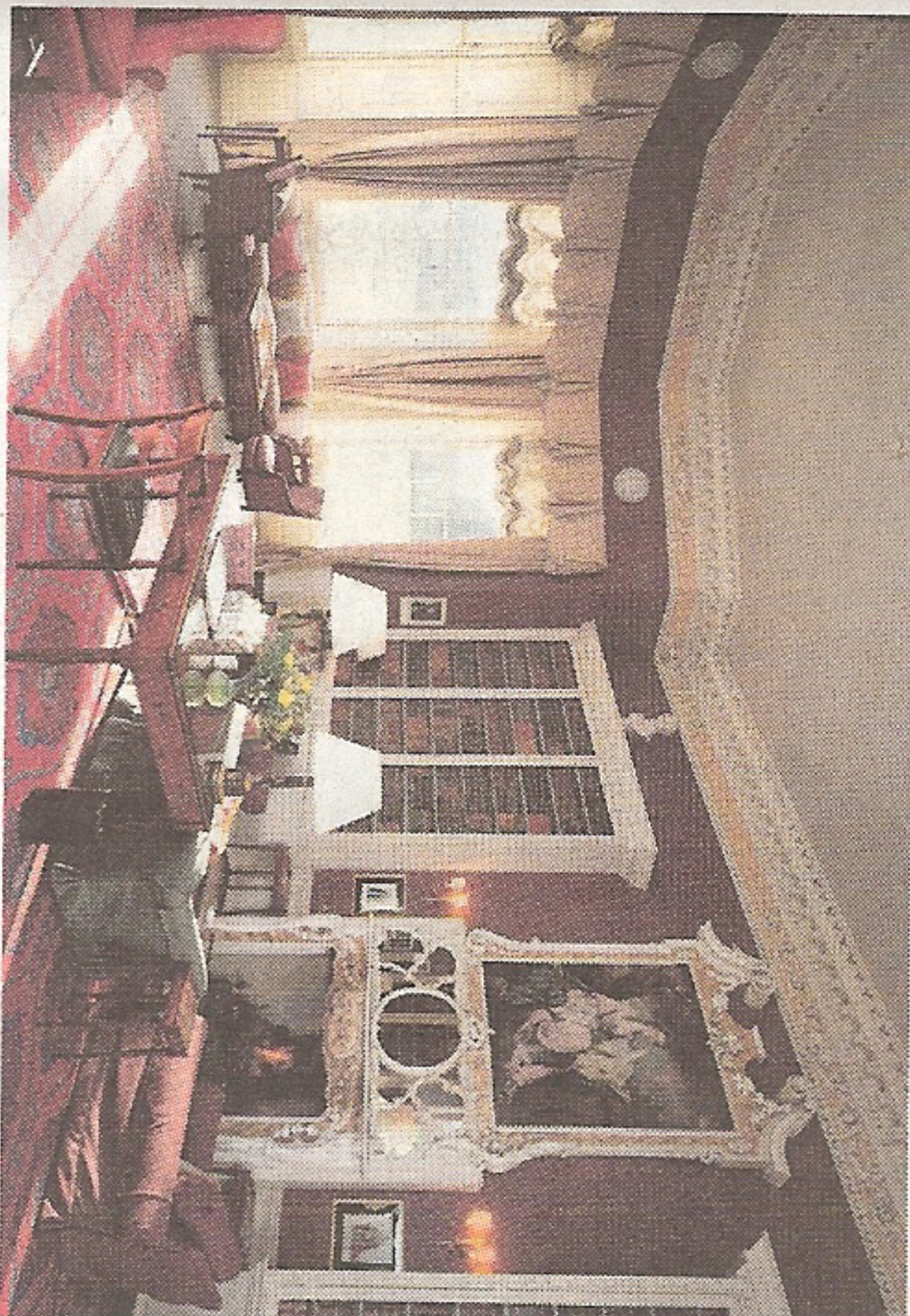
The Louis XVIII library at Hartwell House is just one highlight

The modern Hartwell House & Spa ( hartwell-house.com ) is one of Buckinghamshire's most widely celebrated country houses. This impressive Grade I listed house, which has both Jacobean and Georgian facades, also contains rooms with rococo ceilings, and unique antique furniture and paintings.