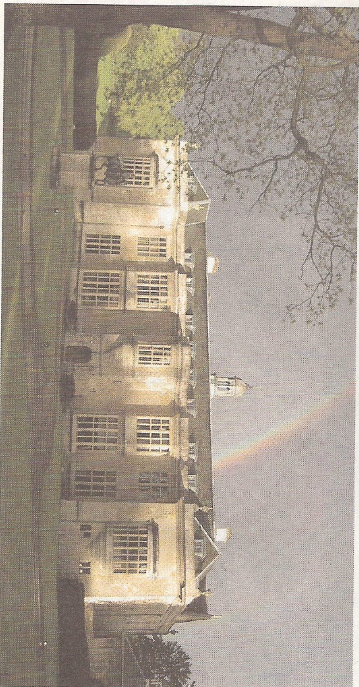
The beautiful grounds of Hartwell House make it one of Buckinghamshire's top attractions

All set in 90 acres of landscaped parkland, this National Trust property features outstanding decorative plasterwork and paneling throughout its elegant reception and dining rooms.