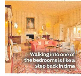
Walking into one of the bedrooms is like a step back in time

WE LOVE IT? The exiled King of the South Sea Islands stayed at Hartwell House and we were certainly royalty during our stay. After sipping