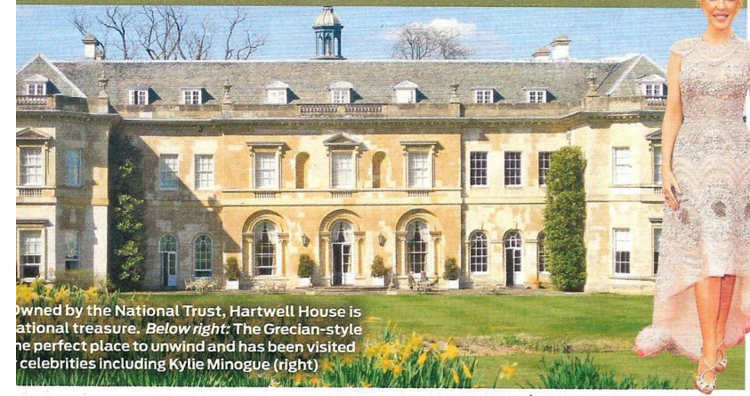
Owned by the National Trust, Hartwell House is a national treasure. Below right: The Grecian-style is the perfect place to unwind and has been visited by celebrities including Kylie Minogue (right)

IT? The Georgian manor in Aylesbury in Buckinghamshire is steeped in history so that when OK! steps out onto the grand wooden doors, we find ourselves on the set of Downton Abbey without the drama! Owned by the National Trust, Hartwell House is a historic House Hotel, and the manor is complete with a dining room, eat hall, drawing room, bar.