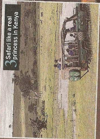
3 Safari like a real princess in Kenya