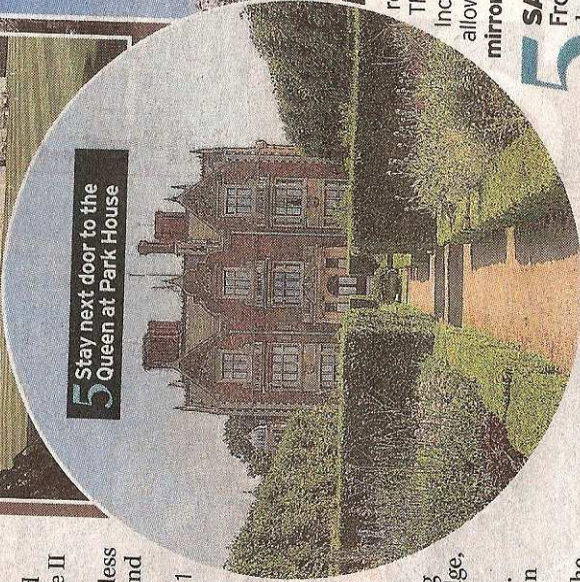
5 Stay next door to the Queen at Park House