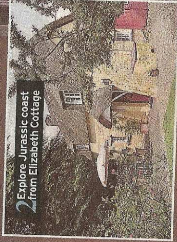
2 Explore Jurassic coast from Elizabeth Cottage

4 ALL-CONQUERING Two nights from £310pp Hartwell House & Spa has a royal history which stretches back