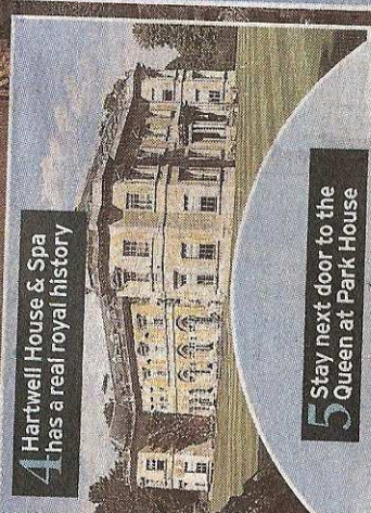
4 Hartwell House & Spa has a real royal history