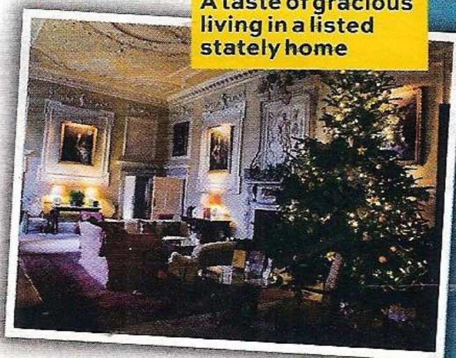
A taste of gracious living in a listed stately home

Sip cocktails and graze on canapés before being serenaded by a pianist during a celebratory luncheon (until 22 December). Choose from delights like gin-cured sea trout, pheasant