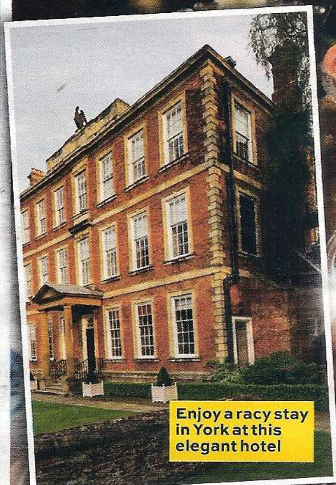
Enjoy a racy stay in York at this elegant hotel

Take a winter break at National Trust stately home. From tea by the fire to feasts of seasonal game sipping cocktails in a spa 'tis the season to be jolly.