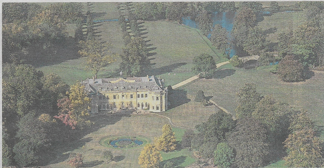
MAGNIFICENT GROUNDS: Hartwell House Hotel, Buckinghamshire sits within National Trust parkland